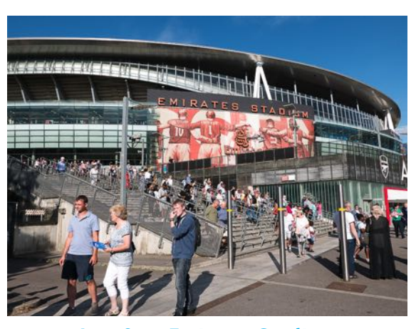
Just One: Emirates Stadium

ello Everyone, and welcome to this Spring 2018 Edition of LifeNews . LifeNews is a publication which tells of some of the many wonderful things that have happened at River of Life Church in the previous 12 months. The features are written and presented by ordinary people who are members of our congregation and who have found a real and living faith in Jesus Christ. Real testimonies of real events that have occurred in the everyday lives of real people.