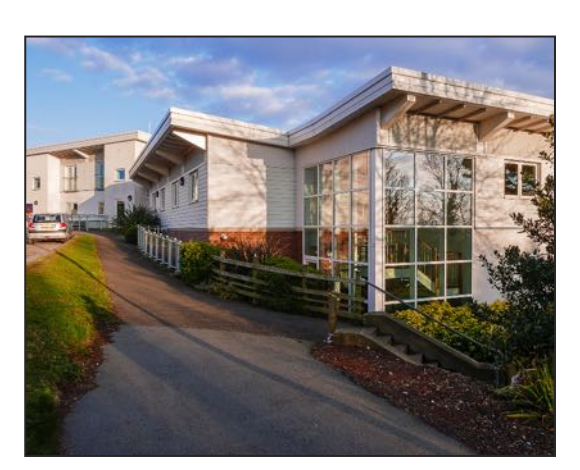
Cotman House Care Home